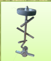
Stainless steel agitator