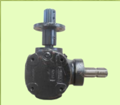
Cast iron gearbox