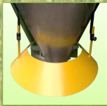
Deflector to limit spreading width